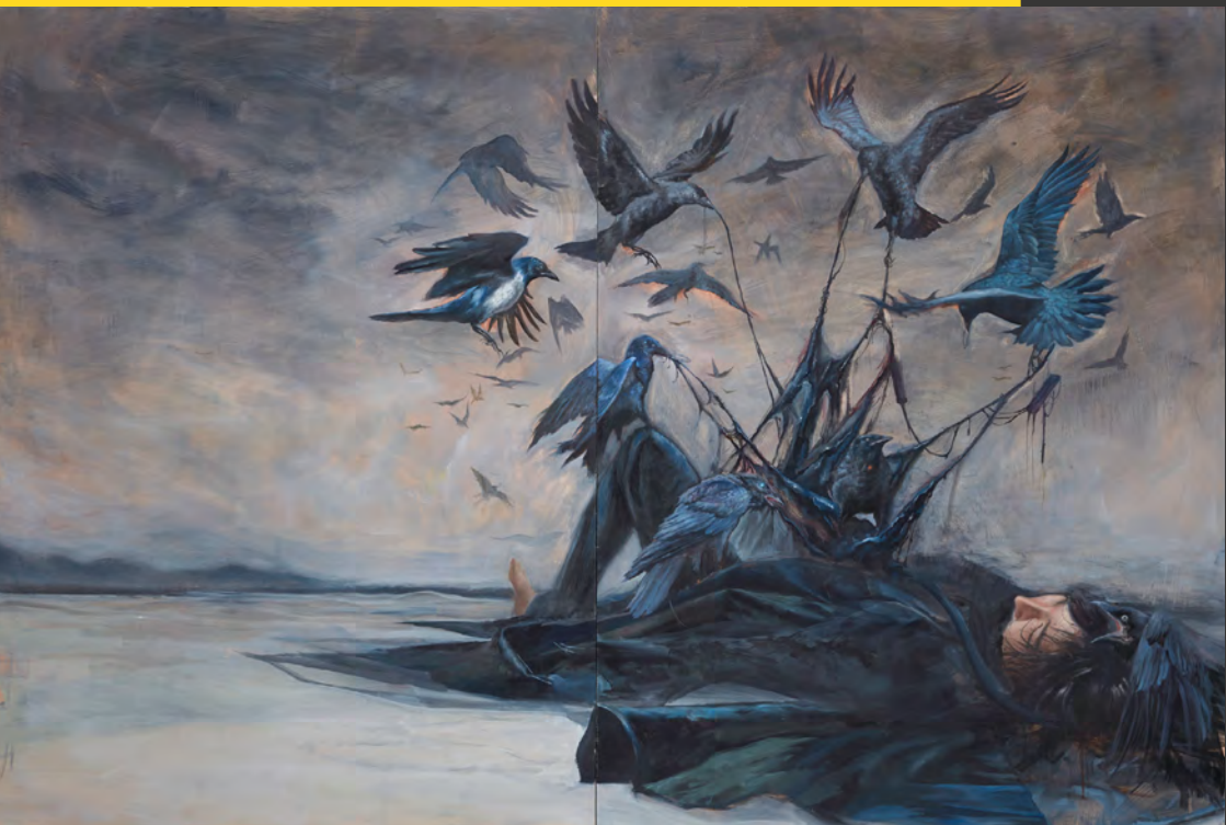
Celeste Yun Hang The Last You 2022 © Celeste Yun Hang