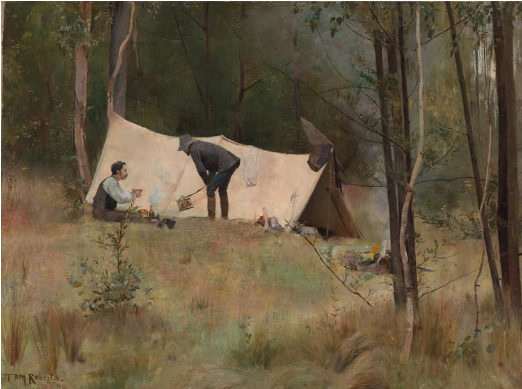
Tom Roberts The artists' camp (1886) oil on canvas 46.0 x 60.9 cm National Gallery of Victoria, Melbourne Felton Bequest, 1943