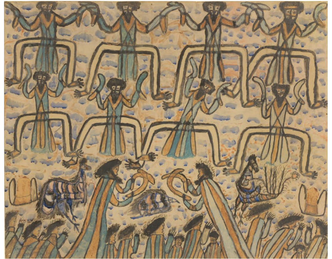
William Barak Untitled (Ceremony) 1900 earth pigments, watercolour and pencil on paper 50.5 x 63.0 cm (image and sheet) National Gallery of Victoria, Melbourne The Warren Clark Bequest, 2001