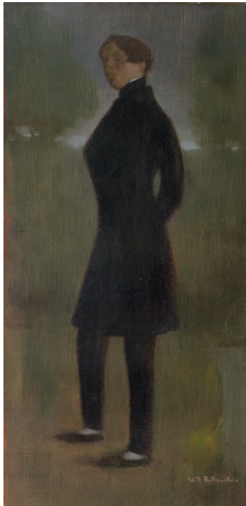
(left) William Rothenstein Charles Conder (c. 1891-1892) oil on canvas 64.9 x 32.0 cm National Gallery of Victoria, Melbourne Purchased, 1966