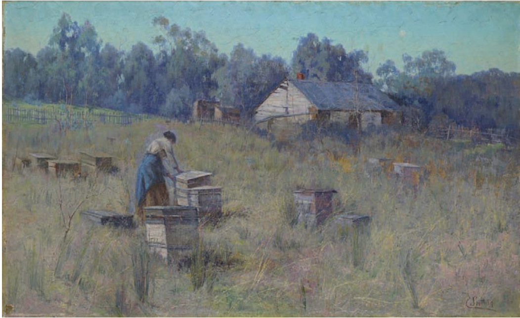
Clara Southern An old bee farm (c. 1900) oil on canvas 69.1 x 112.4 cm National Gallery of Victoria, Melbourne Felton Bequest, 1942