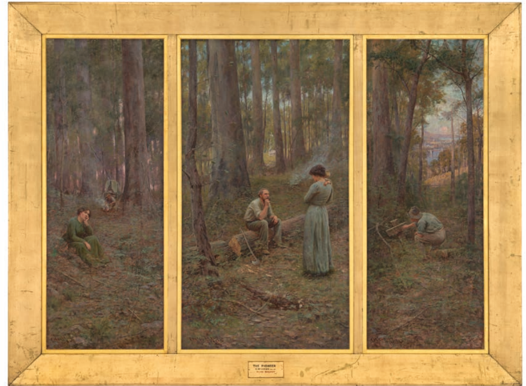
Frederick McCubbin The pioneer 1904 oil on canvas 225.0 x 295.7 cm National Gallery of Victoria, Melbourne Felton Bequest, 1906