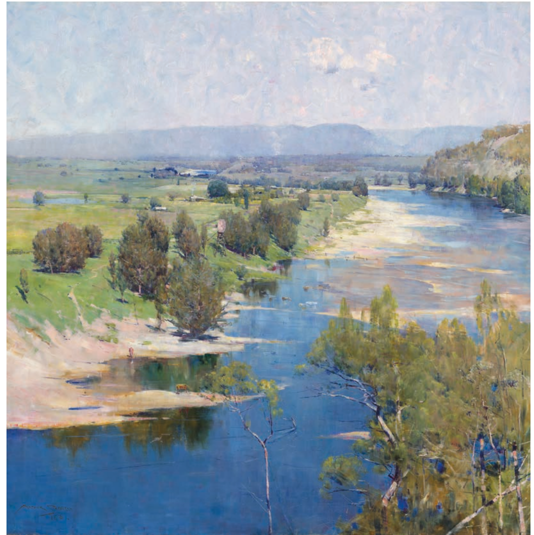
Arthur Streeton ' The purple noon's transparent might ' 1896 oil on canvas 123.0 x 123.0 cm National Gallery of Victoria, Melbourne Purchased, 1896

Watch a video with NGV Head of Conservation, Michael Varcoe-Cocks, discussing Arthur Streeton's work, ' The purple noon's transparent might '.