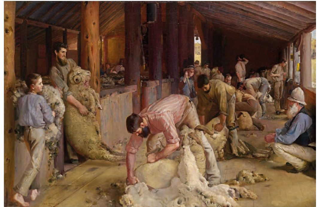
Tom Roberts Shearing the rams 1890 oil on canvas on composition board 122.4 x 183.3 cm National Gallery of Victoria, Melbourne Felton Bequest, 1932