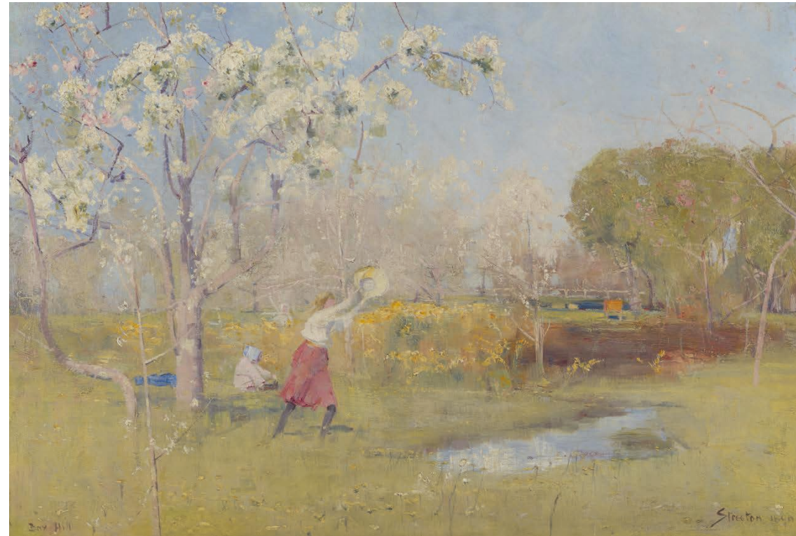
Arthur Streeton Butterflies and blossoms (1889); (1890) {dated} oil on canvas on composition board 45.6 x 66.0 cm National Gallery of Victoria, Melbourne Purchased with the assistance of a special grant from the Government of Victoria, 1979