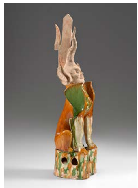
CHINESE Guardian spirit 700 CE–750 CE earthenware (Sancai ware) 74.4 x 23.4 x 19.5 cm National Gallery of Victoria, Melbourne Felton Bequest, 1926