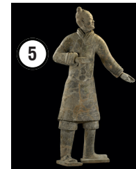
5 Standing Archer 221–207 BCE