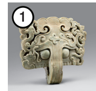
1 Door ring holder in the form of a mythical beast, Pushou 207 BCE–220 CE

Artworks are hung overhead throughout the exhibition.