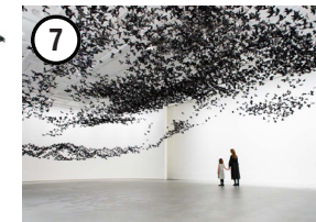
7 Cai Guo-Qiang Murmuration (Landscape) 2019