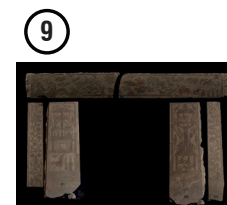
9 Tomb gate 25–220 CE