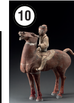
10 Large cavalryman 207 BCE–9 CE