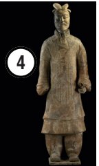
4 Armoured general 221–207 BCE