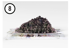
8 Cai Guo-Qiang Transience I (Peony) 2019