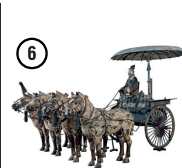
6 Chariot #1 (Qin dynasty replica)