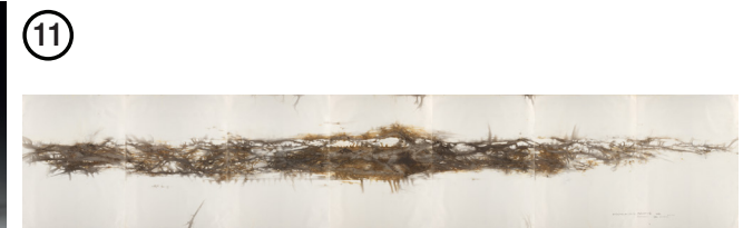
11 Cai Guo-Qiang Pulse (Mountain) 2019