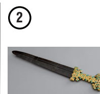
2 Sword with inlaid hilt 771–475 BCE