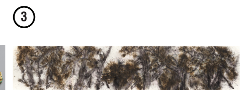
3 Cai Guo-Qiang Flow (Cypress) 2019