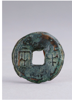
Qin state coin with half tael inscription 秦半两 Qin Dynasty 221–207 BCE bronze 3.5 x 0.15 cm Collected by Suide County Museum, Yulin, 1993 Yulin Institute of Cultural Heritage Conservation, Yulin (钱001)