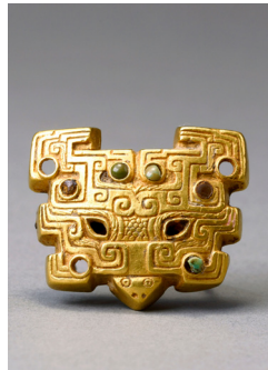
Ornament with zoomorphic design 兽面金方泡 Spring and Autumn Period 771–475 BCE gold, inlaid stones 3.3 x 3.9 x 0.1 cm Baoji City Archaeological Team, Baoji (BYM2:27)