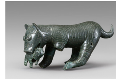
Tiger mother with cub 衔子铜虎 Western Zhou Dynasty 1046–771 BCE bronze 10.0 x 20.0 cm Excavated at Xizhou Ruins, Rujiazhuang, Baoji, 1988 Baoji Bronze Museum, Baoji (07648/IA11.584)