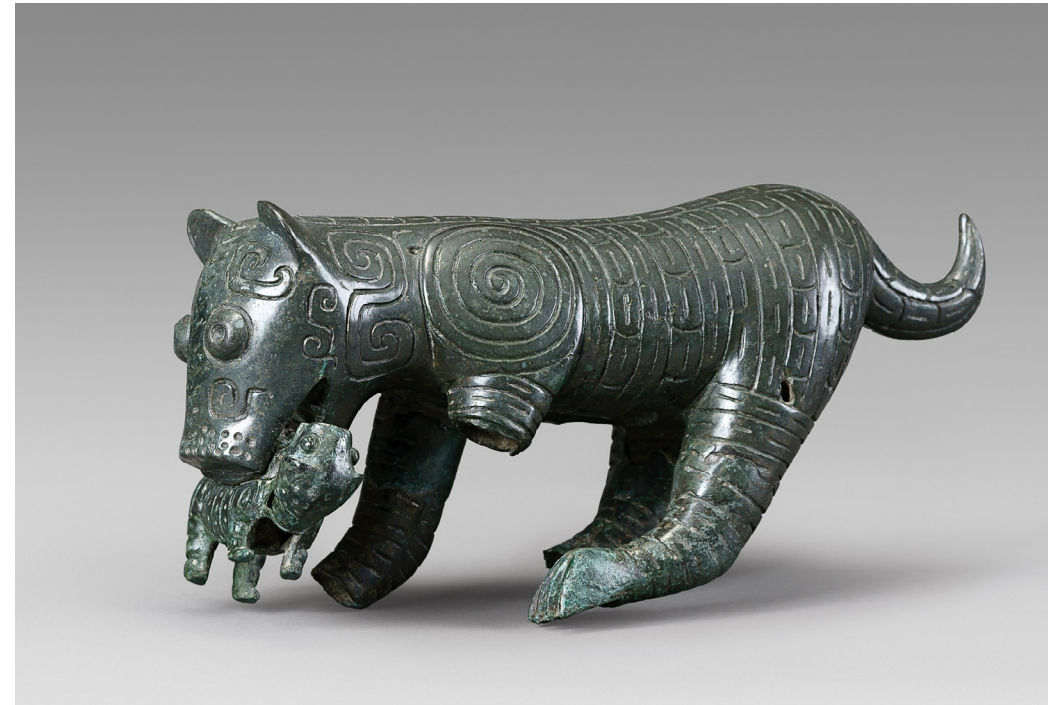
BELIEFS, VALUES AND PRACTICES: ANIMALS

The emperor's tomb has never been excavated. Why might this be? Conduct some research into the conservation of the terracotta army. What are some of the key threats to these artefacts? What measures are being taken by conservators to protect the objects?