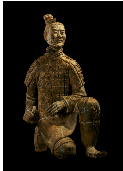
TERRACOTTA WARRIORS: AN ARMY FOR THE AFTERLIFE