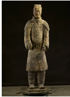
Armoured military officer 中级铠甲军吏俑 Qin Dynasty 221–207 BCE earthenware 190.0 x 56.0 x 58.0 cm Excavated from Pit 1, Qin Shihuang's mausoleum site, Lintong District, Xi'an, 1978 Emperor Qin Shihuang's Mausoleum Site Museum, Xi'an (002758)