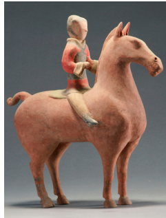
Large cavalryman 彩绘骑马俑 Western Han Dynasty 207 BCE–9 CE earthenware, pigments 68.0 x 63.0 x 23.0 cm Xianyang Museum, Xianyang (YQD014)