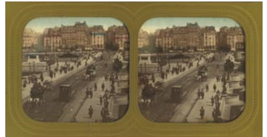
Fig. 1 J. M. Pont Neuf, Paris 1870s albumen silver photograph, watercolour Gift of Mrs K. Cunningham, 1988

Using a process that was both as ordered and magical as the city itself, photographers recorded the evolution of this extraordinary city of contradictions. For the first time, French artists and amateurs could accurately capture with the camera the world around them and, from the 1830s, they often did so with a pictorial and technical sophistication that is still impressive. One of the favoured subjects of the period was the physical environment of Paris, partially because long exposure times could not capture the energy and movement of street life (making buildings a better option) but equally because of the inherent interest in Haussmann's radical transformation of the city. In some of his most dramatic changes he progressively created boulevards from the narrow laneways that ran through Paris; rebuilt the Île de la Cité into an administrative and religious centre; and annexed the suburbs into twenty districts. The changes brought physical order to the city but also a profound sense of dislocation for many of its inhabitants (fig. 1). As Haussmann reflected some thirty years later: