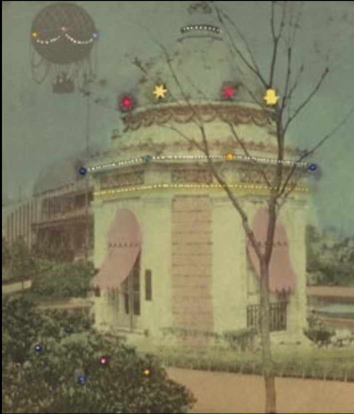
Paris and Photography 1850s–1930s