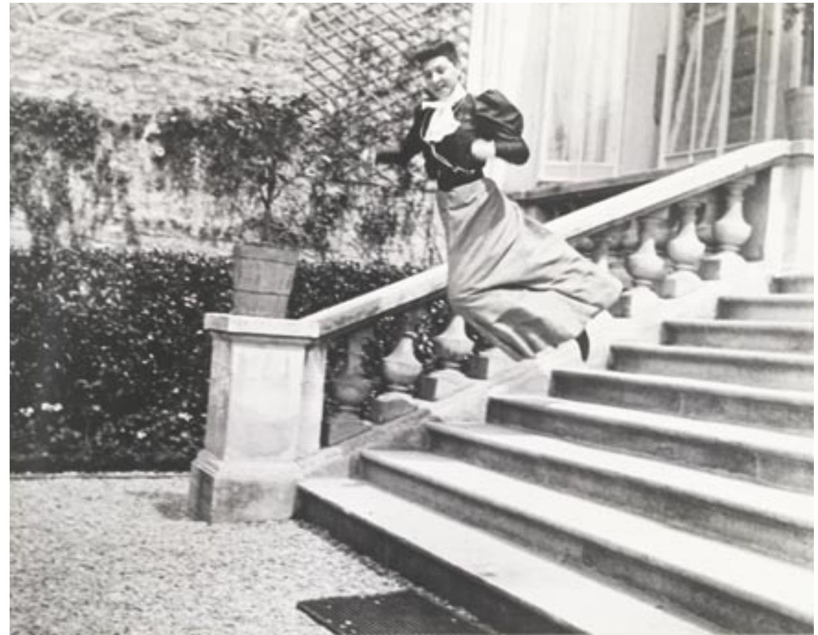
left: Fig. 10 Jacques-Henri Lartigue Auteuil 1912, printed 1973 gelatin silver photograph Purchased, 1974

A more restrained view of the female body is apparent in the charming work of Jacques-Henri Lartigue, a child protégé who took a celebrated series of photographs of elegant Parisienne women of the belle époque around 1911 (fig. 10). The period from the 1890s to 1914 was a generally settled and prosperous one in Paris, and Lartigue's work perfectly captures the mood of the times as reflected in the idyllic and inventive escapades of his own bourgeois family. Lartigue was given a camera by his father in 1901, when he was only seven years old and, with a child's curiosity for life, he used it to record the joyful activities of his family and friends (fig. 11). He placed the hundreds of tiny photographs he took in 125 private albums but it was not until the 1960s that Lartigue's work became publicly known when he reprinted his work and began to exhibit.