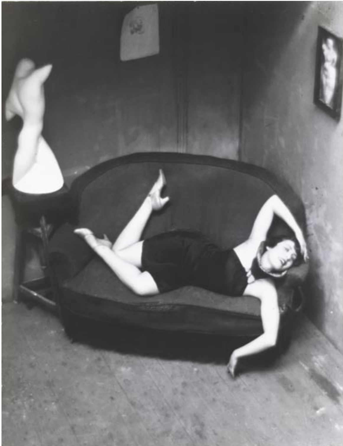
Fig. 13 André Kertész Satiric dancer, Paris 1926, printed c.1972 gelatin silver photograph Purchased, 1973

His night-time forays were inspired documentary projects, but they also aligned with the Surrealist interest in walking as a means to access the unconscious, especially at night, a time when the familiar became unfamiliar. Brassai operated as a true flâneur , or stroller through the city, recording the human activities of this hidden side of Paris with affection and respect (fig. 14).