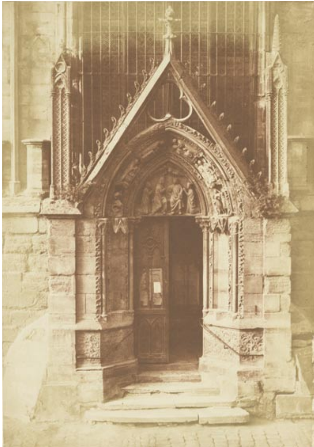
left: Fig. 3 Henri Le Secq Notre Dame, Paris 1849 salted paper photograph Presented by the National Gallery of Victoria's Women's Association, 1995