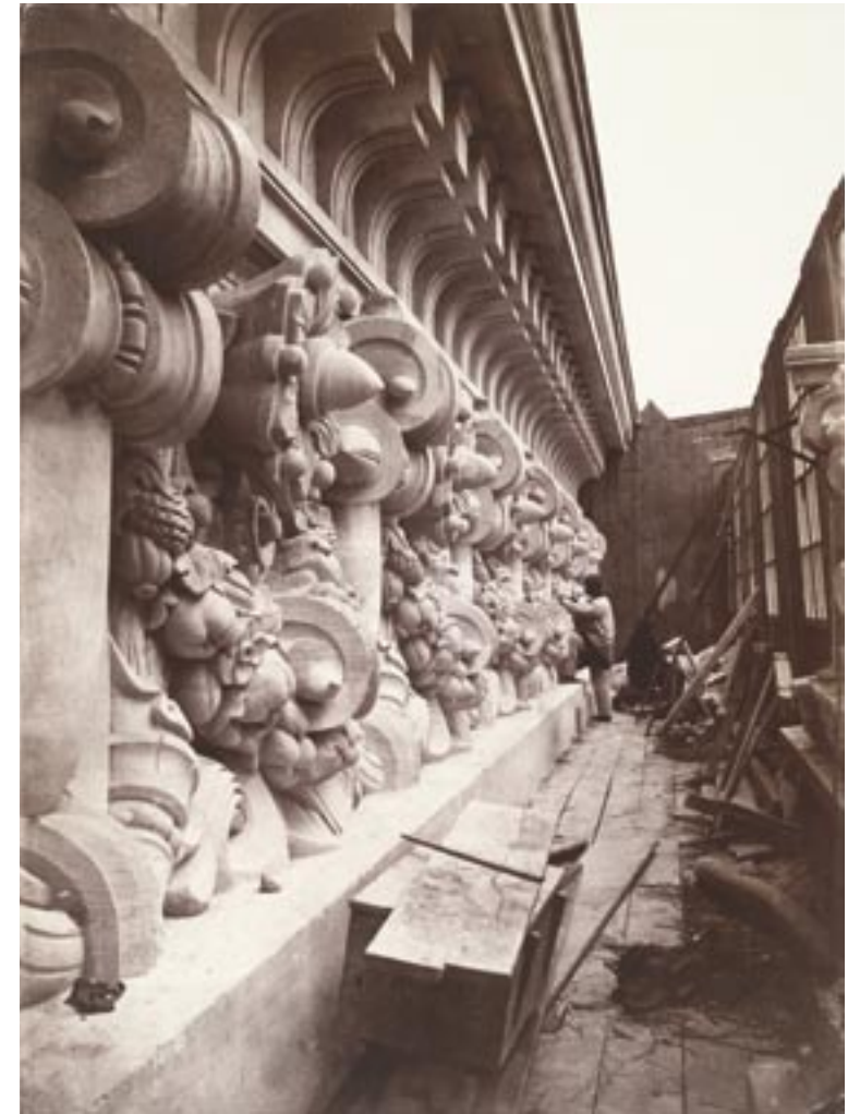
right: Fig. 4 Louis-Emile Durandelle Clémence Delmaet The new Paris Opéra, ornamental sculpture c.1870 albumen silver photograph Presented by the Lunn Gallery, Washington, 1982

The exhibitions also gave photographers the chance to show off their prowess with the medium. Adolphe Braun was best known as a fabric designer but in the 1850s he created a series of floral still lifes as a reference for artists and designers (fig. 6). The photographs were included in the 1855 Universal Exhibition where they were acclaimed for their delicacy of tone and compositional skill. For Braun, and many other French photographers, the exhibition provided a high-profile venue for the promotion of the medium as art, but the critical reception to their creative aspirations was varied. As one sign of photography's mixed fortunes it is interesting to consider the changing physical location that it occupied within the exhibitions. In 1855 photographs were displayed in the Palais de l'Industrie as part of a bazaar featuring the latest technological and scientific innovations. By 1859 pressure on the organisers saw photography upgraded slightly as it was moved to a location physically on the same level as painting but – symbolically – with its own separate entrance.