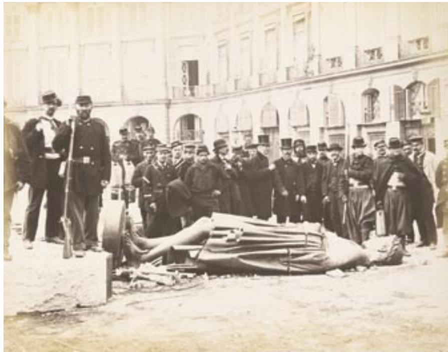
Fig. 5 Bruno Braquehais Statue of Napoleon after the fall of the Column Vendôme ( Statue de Napoleon après la chute de la Colonne Vendôme ) 1871 In the album Siege of Paris ( Siège de Paris ) 1871 Purchased 1980

In one of the more dramatic images (fig. 5), Braquehais shows the temporarily victorious Communards – including the famous painter Gustave Courbet (tenth from the right in hat and full beard) – shortly after the destruction of the Vendôme Column. As head of the Arts Commission, and a passionate member of the Communards, Courbet was pivotal in felling this symbol of French imperialism. While Courbet survived the insurrection, photographs such as these were subsequently used as evidence to convict and, in some cases, condemn many rebels to death.