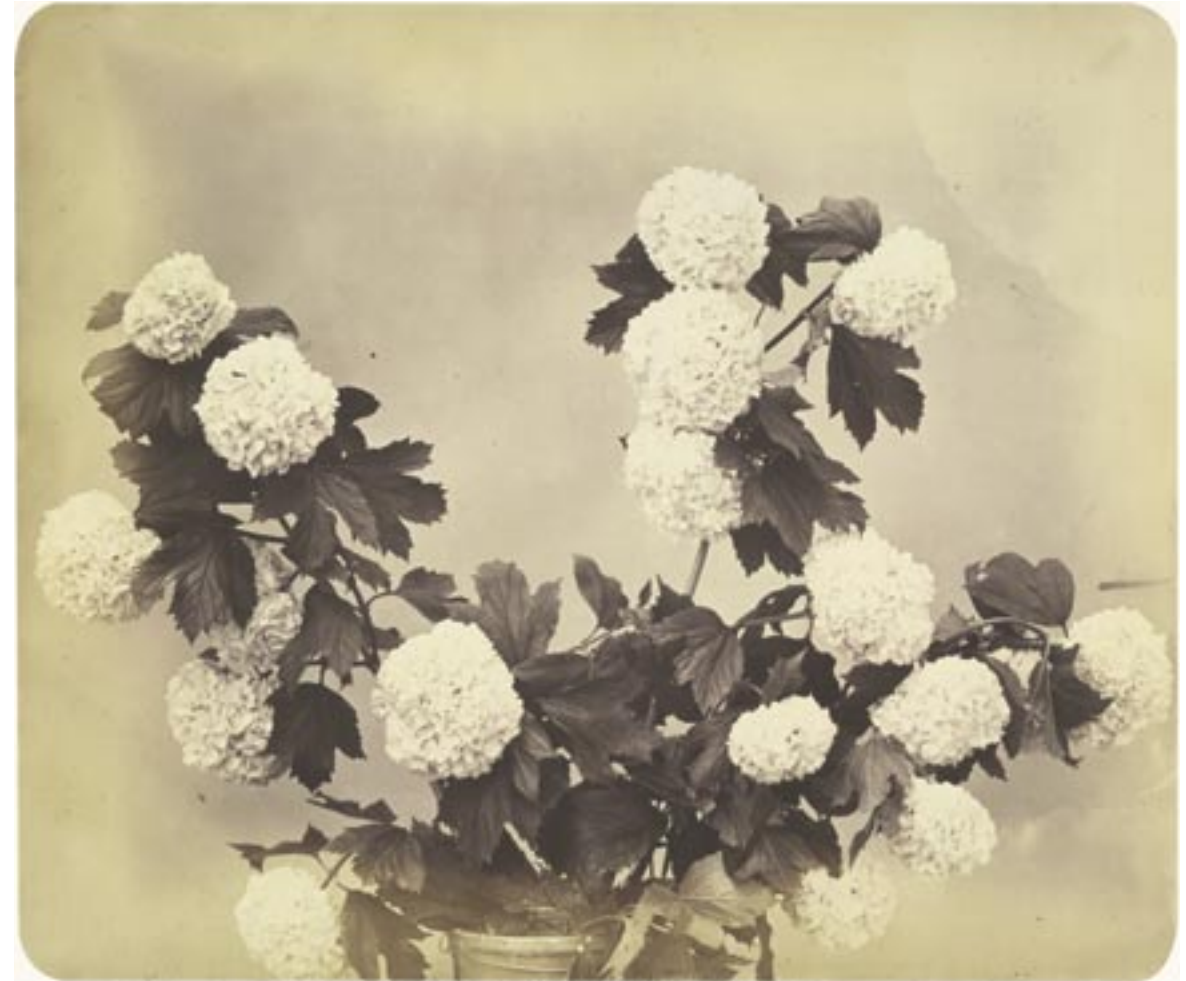
Fig. 6 Adolphe Braun No title ( Flower study ) 1854 albumen silver photograph Presented by the National Gallery of Victoria Women's Association, 1995