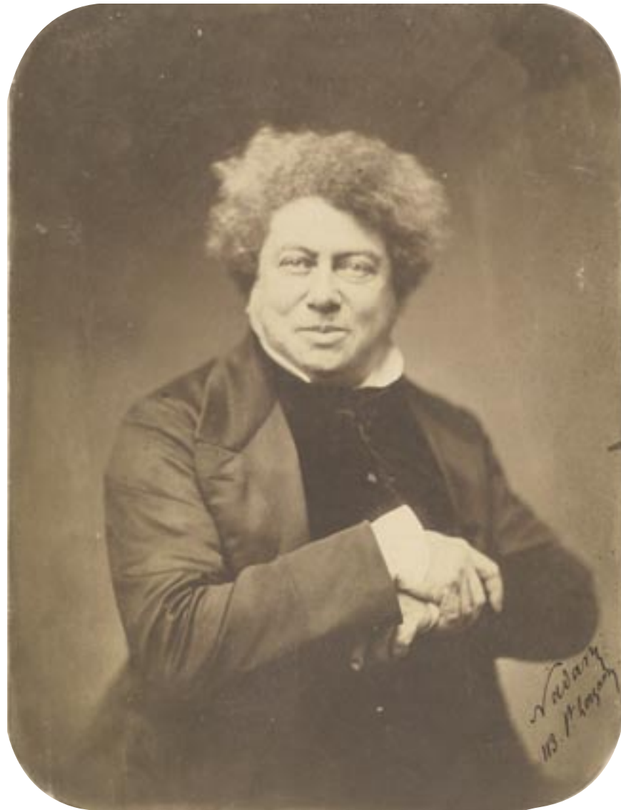
Fig. 7 Félix Tournachon Nadar Alexander Dumas (père) 1855 salted paper photograph Presented by the National Gallery of Victoria Women's Association, 1995

THE PAGEANT OF FASHIONABLE LIFE AND THE THOUSANDS OF FLOATING EXISTENCES ... DRIFT ABOUT IN THE UNDERWORLD OF A GREAT CITY. THE LIFE OF OUR CITY IS RICH IN POETIC AND MARVELLOUS SUBJECTS. WE ARE ENVELOPED AND STEEPED AS THOUGH IN AN ATMOSPHERE OF THE MARVELLOUS; BUT WE DO NOT NOTICE IT. 5